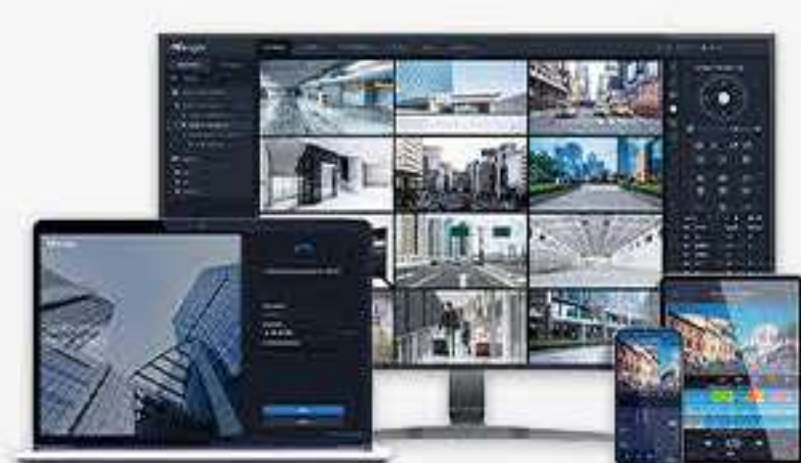
Milesight VMS Enterprise