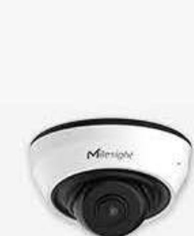
AI IR Mini Dome Camera