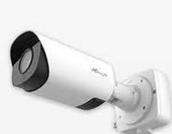
AI 4X/12X Pro Bullet Plus Camera