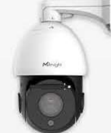
AI 25X/30X Speed Dome Camera